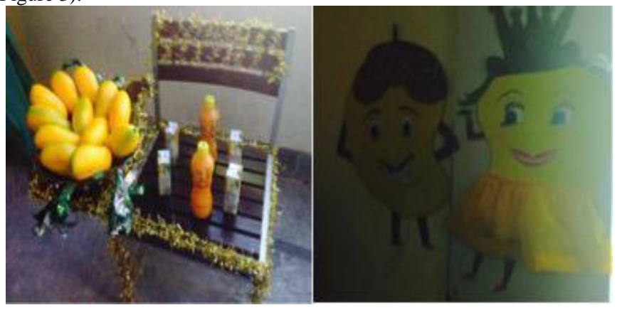
Figure 3. Photographs taken during students' presentation on "Mango Season in Pakistan" in Ruby's class.

During the classroom observation of one of the presentations on 'Mango Season in Pakistan,' it was noticed that all the students in the presenting group wore yellow color clothes corresponding with the color of mangoes (Field notes, May 16, 2015). Also, the presenting group decorated the classroom walls with images of mangoes and shared some real mangoes and mango juices with their teacher and classmates (see Figure 3).