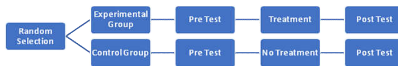
Figure 1: Pre-test post-test control group design

The design of the study was truly experimental. It was decided to use the demonstration method, so it was necessary to select a homogenous group through a random sampling technique. Figure 1 shows the systematic description of the design.