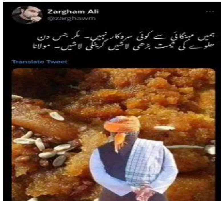
Figure: 8, Source: Google

strategies of Zardari. It reveals that Zardari is more active than other politicians after the election as the majority of the politicians work hard day and night, doing campaigns before the election in order to win while he does not play in the court like them. This picture reflects public reviews about his campaign of election's strategies and his impression over the public as smart and active politicians who have power. This meme implies indirectly that his way of work or politics is notably different from other politicians while criticism prevailing in the image makes it more interesting by adding laughing emoji in it which shows the traditional way of satire for political scenarios as it is understood that emoji adds up the spice in the market of emotions and feelings.