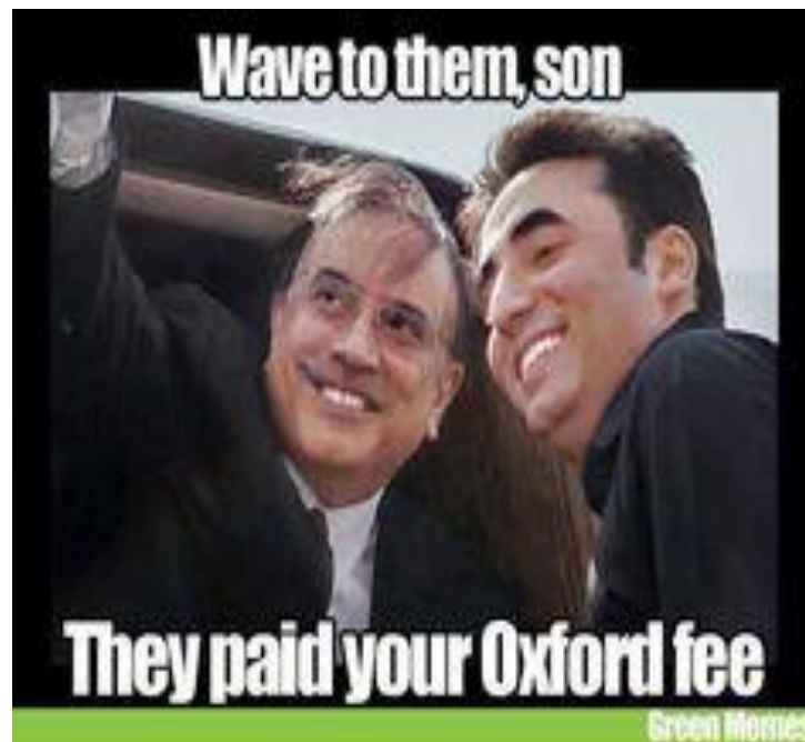
Figure: 2

conveys a feeling of mutual expectation and maybe irritation. The reaction from the Election Commission seems to indicate some understanding or recognition of the public's worries. A high degree of interest or stakes in the outcome may be indicated by the public's excitement for the outcomes. The Election Commission's answer may indicate that they are conscious of the public's expectations and the significance of accurate and fast results. The public's and the Election Commission's power dynamics may be highlighted by this exchange. While the public voices their expectation, the Election Commission's reaction suggests a degree of power and accountability by positioning them as the authority in charge of presenting the results. In short, this image describes the situation prevailing at the time of result announcement.