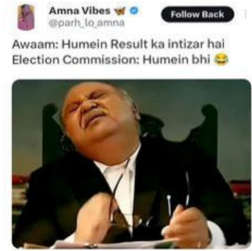
Figure: 1, Source: Google, April, 2024

Textual analysis highlights the literal as well as contextual usage of the meme and focuses on the over socio-political scenarios prevailing in the society.