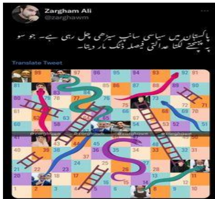
Figure: 6

of railways, roads and bridges. The following image presents the scenario of a formal seminar or meeting in which Prime Minister is delivering a speech. The officials of army are there but they are seated apart which may highlight literal or figurative distance. This statement sheds light on the point of view that the military officers' separation from one another, suggesting that the prime minister is ready to fill distance or lack of communication. Apart from its humorous satire the sentence may hint a wish to reduce gaps and foster connections and communication among people or institutions. The picture describes how Pakistan's government and the military establishment are on one page by portraying a formal exchange between the Prime Minister and the military officials. The reality is explained in an effective way through humour.