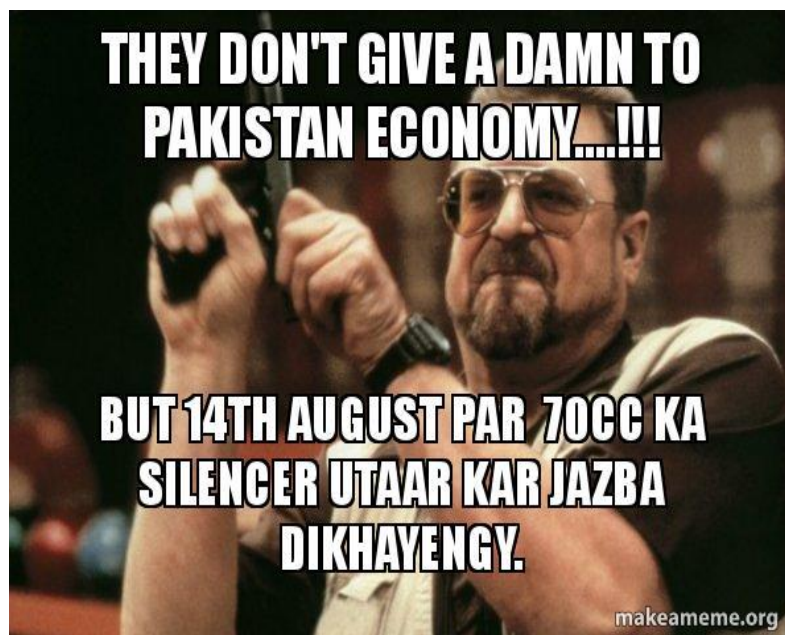
Figure: 4

This image metaphorically describes the political statuses or behaviours of major political leaders in Pakistan by using the varied states of a mobile phone. This meme is analyzed by using Fairclough's 3D model of Critical discourse analysis. The armed forces are represented by this state. The military is implied to be active and present in the metaphor, which probably means that it is in control or influence. While silent situation, describes the spokesperson for an unidentified politician. This might include to maintain caution, making no public announcements or appearances, or working behind the scenes. On the other hand, Outdoor scenario, where Imran Khan is represented by this state. While vibrating state is referring to a person who is in touch on and off and the last state offline refer towards Nawaz Sharif which reveals lack of presence or less interest in an activity. This picture makes use of mobile phone states to offer a complex and multi-layered commentary on the functions and actions of many political organizations and figures in Pakistan. This meme describes multiple layers of action, and activity by the actors in the political circumstances by drawing comparisons through digital technology in order to make complex decisions or works further accessible and understandable. Every feature of a mobile phone is describing a state of popularity among public and criticizes people.