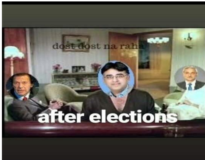
Figure: 9, Source: Instagram April,2019

of this sweet desert which highlights the priorities of this figure. The text in this picture criticizes that he has more concern with the cost of this desert rather than the economic problems of Pakistan's economy. It discloses that he is more interested in his personal or in significant matters rather than the important economic condition of Pakistan that has impact on public. Through this meme, it is understood that the public find humour and satire as this sweet dish is considered as a prominent cultural dish in Pakistan. So, this matter for has greater significance. It also presents the scenario that leadership has their own priorities rather than the profits of their country. This meme is analysed using three dimensional model of critical discourse analysis. Humour and satire in this picture lessens the effect of criticism.