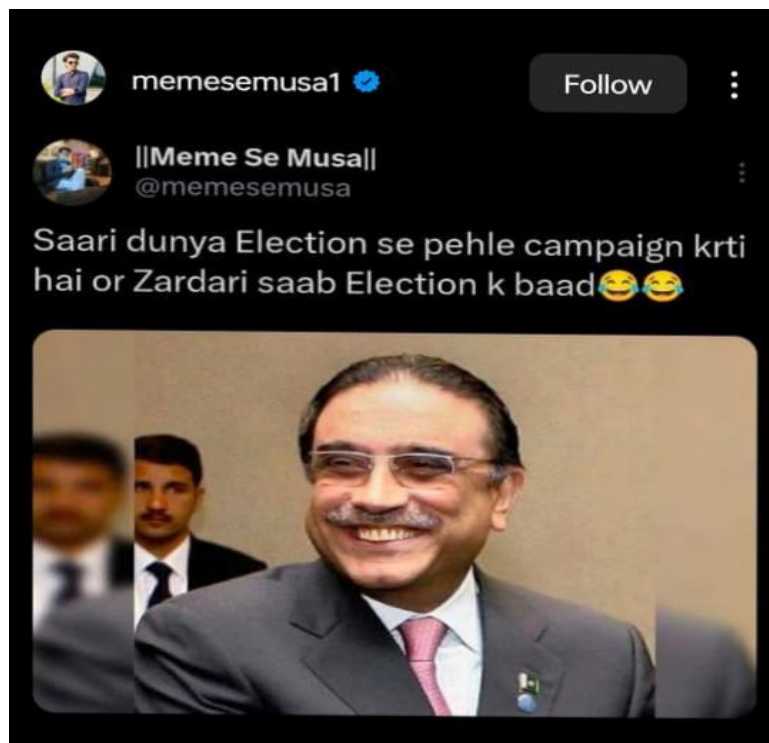
Figure: 7, Source: Google

and sudden defeats for people. It presents a notion that those people who are near to achieve success are let down by the judiciary's role in politics. This game used as a metaphor that draws attention towards unstable politics in Pakistan. This may highlight the deep coated roots of law in politics that court rulings have a significant impact on politics in positive as well as negative aspects. This image presents a criticism over the political system by describing the unexpected of court decisions and their influence on political system. It presents the conflict between politics and the law. In short, focuses on the views of justice and discrepancies in the political system of Pakistan.