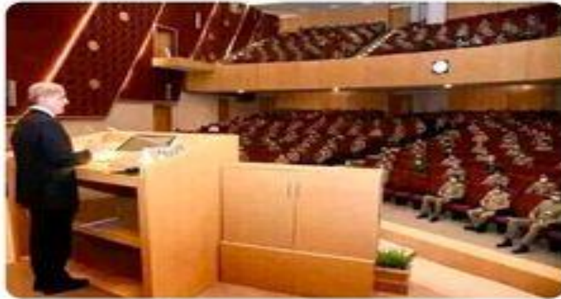
Figure: 5, Source: Google

"ap itni door door bethay hain, ap k beech bhi pul bana doon?"